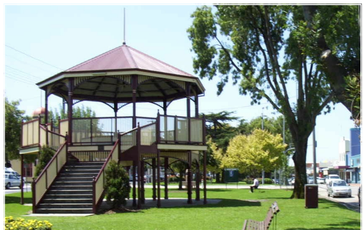
East Gippsland's climate is temperate so you can enjoy milder winters and summers

Bairnsdale's cultural, historical and exciting attractions start in the centre of town. You can begin with the Arts Network Trail or visit nature reserves. Enjoy some of the best fishing, golf, a game of bowls, visit our Aquatic and Recreational Centre or canoe, walk or ride along the Mitchell River.